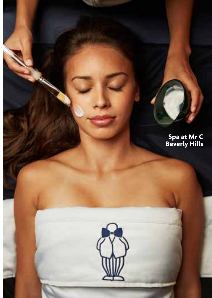
Spa at Mr C Beverly Hills